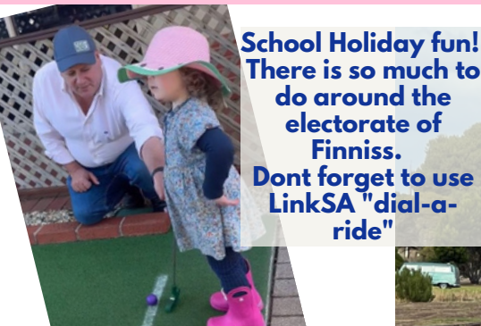
School Holiday fun! There is so much to do around the electorate of Finniss. Dont forget to use LinkSA "dial-a-ride"