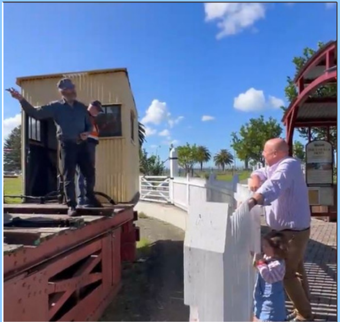
The SteamRanger train was busy in the school holidays, I counted six carriages and hardly an empty seat. Thank you to the volunteers working over the Easter Break!