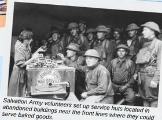
Salvation Army volunteers set up service huts located in abandoned buildings near the front lines where they could serve baked goods.

The tradition of National Donut Day began in 1938 as a way to honor these women & their service to the military.