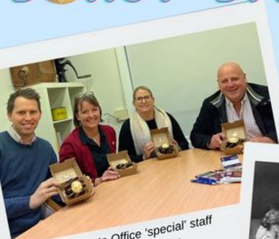
Finniss Electorate Office 'special' staff meeting on National Donut Day