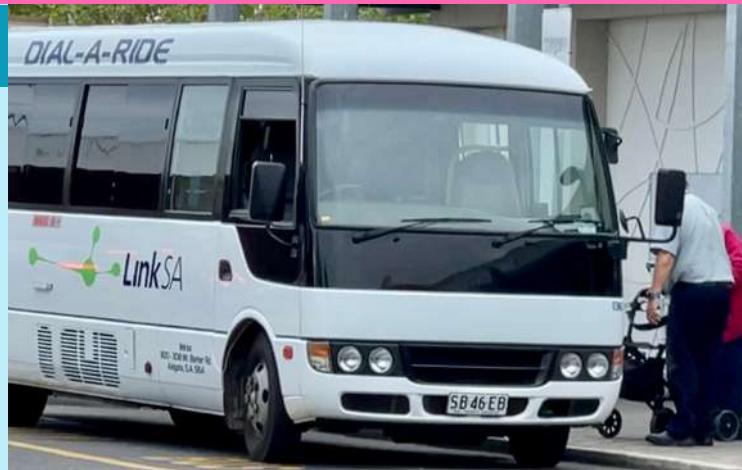
LINK SA DIAL-A-RIDE BUS AT VICTOR CENTRAL

This document & map has been compiled & designed by the Finniss Electorate Office to assist the community with their transport options across the electorate. For printed copies, additions or amendments, please contact the office.